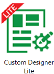
Custom Designer Lite

Custom Designer (Lite) – allows to use built-in/pre-existing label sizes to create new labels (add text, barcodes, images etc.) or to open/edit previously made labels.