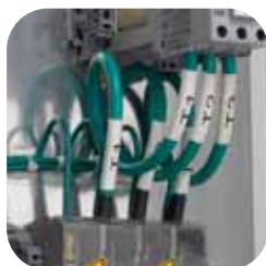
Wire Marking Sleeves