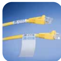
Wire & Cable ID